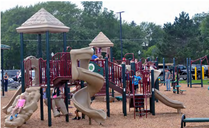
Pictured is the new playground at the Elementary School