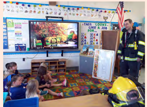
Students gain first-hand knowledge on fire prevention as firefighters visit classrooms.