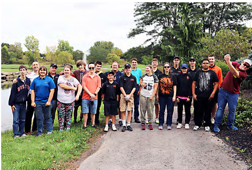
Pictured are BOCES students who participated in the "Golf Training Day" with members of the Wilson golf team.